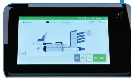
Color Touchscreen Control Panel with graphical interface