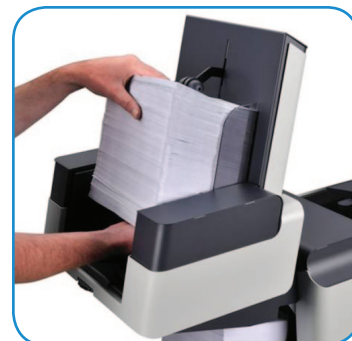
High-Capacity Vertical Output Stacker