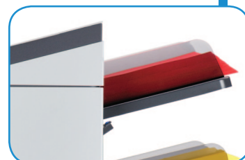
High-Capacity Document Feeder