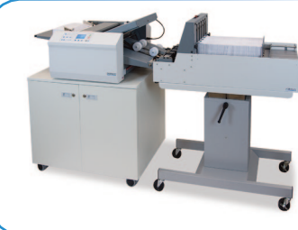
FD 2054 in-line with optional V-Stack36 Vertical Stacker, stand and cabinet

Formax - New Hampshire, USA www.formax.com