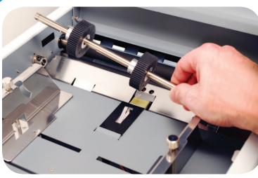
Removable Feed Wheels